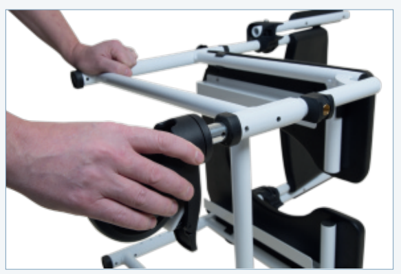
The 5" (125 mm) wheels are easy to mount. All 4 wheels are lockable and equipped with mud flaps.