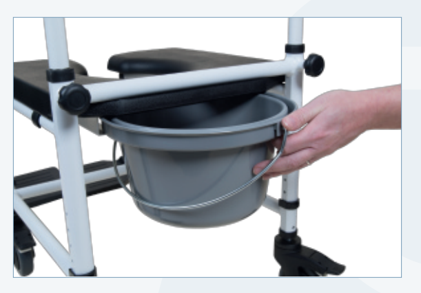
The toilet bucket can be easily removed even when the user is sitting in the chair.